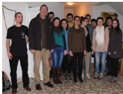
Vivid contacts: The band „Psalite“ from Szeklerland, Transylvania, Romania.