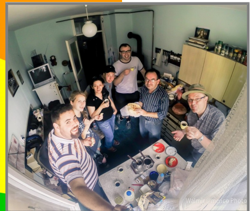
Workshop in Sarajevo, 2014: Our spirituality: In God and with the people.