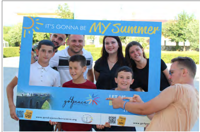
Young people in Shkodra / Albania

And yet everything had started so chaotically. It remained uncertain until the last moment, who would participate in this year's hybrid camp "go4peace 2022 - It's gonna be my summer!" in the Kamen group. German youths had firmly agreed to participate and one by one dropped out again because their plans had changed. Others could only be there for one or two days. And then suddenly there were over 400 Ukrainian refugees in our town of Kamen. We had met many of them during different aid campaigns. We had discovered their talents. Some were excellent at painting, designing and sewing. They had agreed to offer a workshop at the camp, but none of them could imagine what the camp would be like. When we arranged to meet via zoom a few days before the camp, one of the 9 invited participants was present.