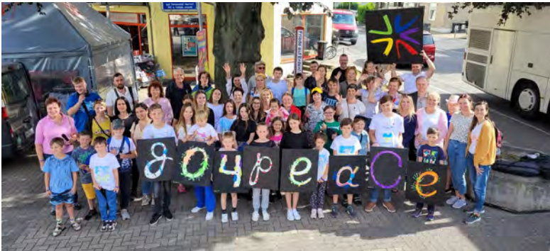
The go4peace-group from Kamen in Dortmund-Wickede

"It's a pity that this week is now coming to an end! It was by far the best I've had since I arrived here in Germany! Sometimes I catch myself thinking that I don't want to go back to Ukraine, because I found something new in this camp that totally fulfils me," is what I read in the WhatsApp message of a Ukrainian woman who has been living with her son in Kamen for half a year.